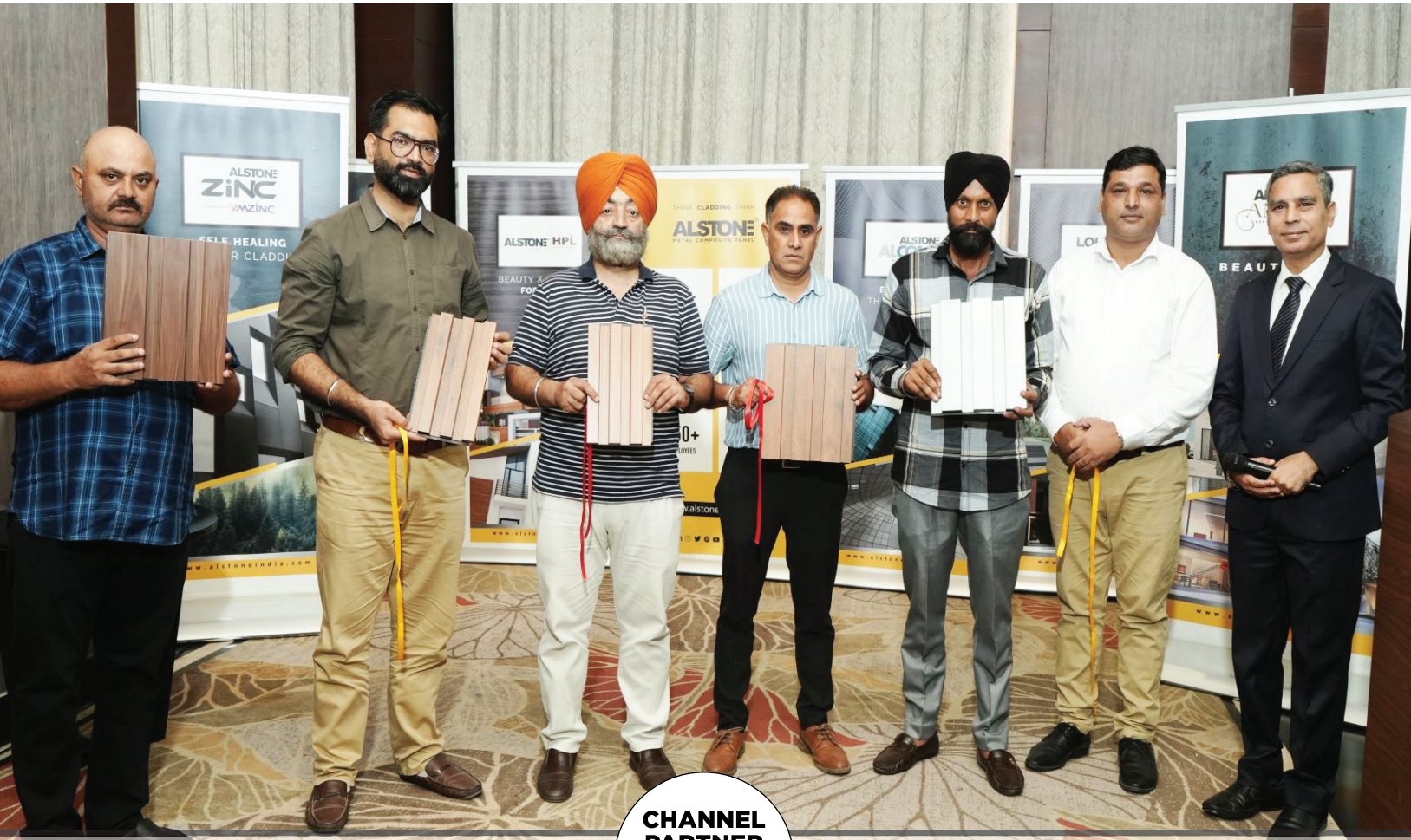
CHANNEL PARTNER MEET, JALANDHAR