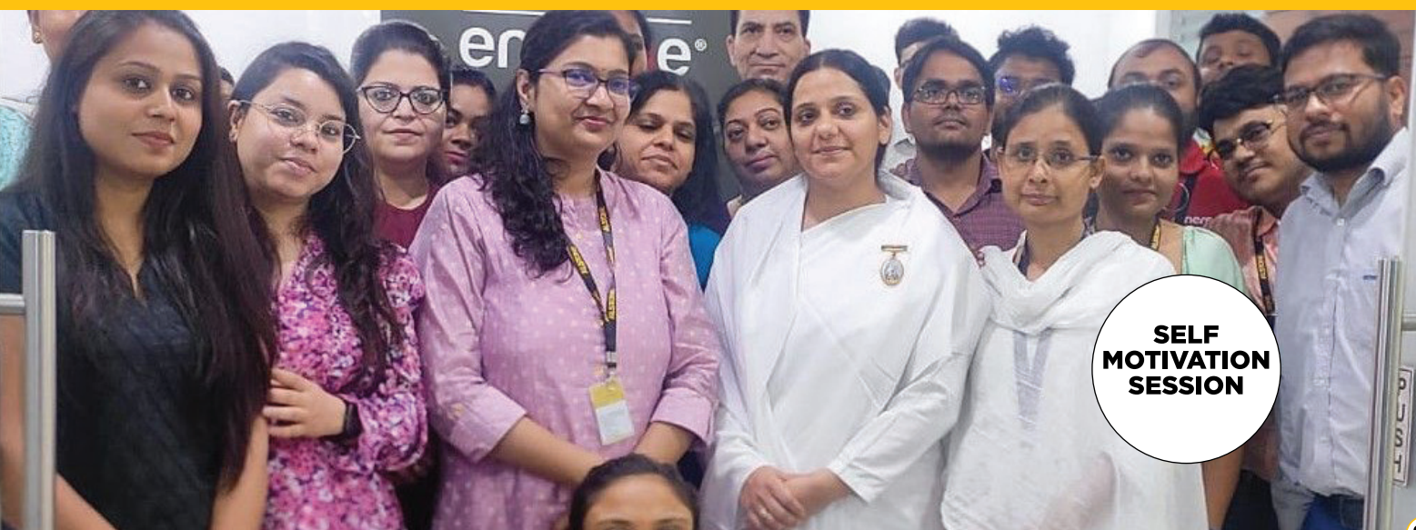
SELF MOTIVATION SESSION