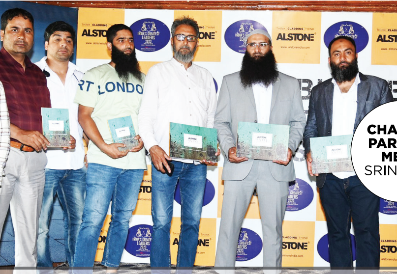
CHANNEL PARTNER MEET, SRINAGAR