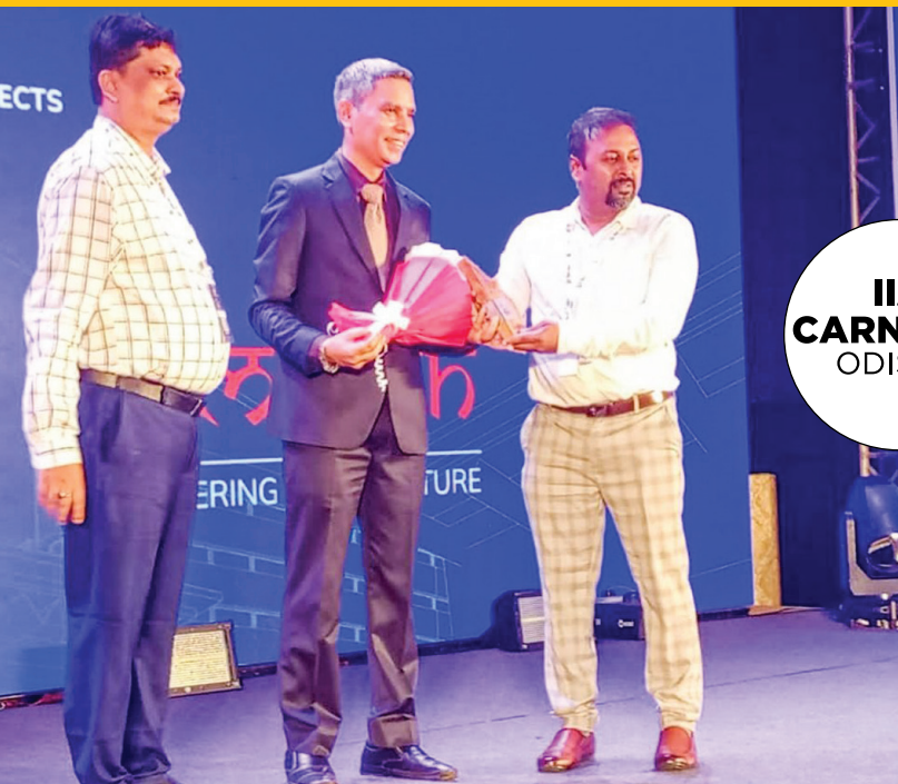
IIA CARNIVAL, ODISHA