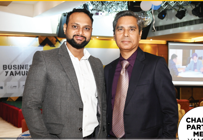
CHANNEL PARTNER MEET, YAMUNA NAGAR